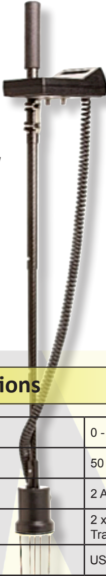
Aggrameter® and Extension Pole