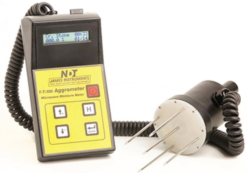
Aggrameter® Instrument and Sensor

For instantaneous determination of the moisture content of sand, fine aggregate and coarse aggregate using a unique microwave sensor