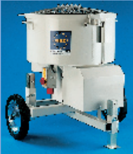
Hand draw bar removable

for comfortable working with maximum ease of operation