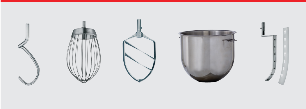
Hook, whip, beater, scraper and bowl 10 L in stainless steel. Scraper with nylon or teflon blade.