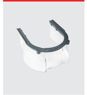
Removable magnetic safety guard. CE-certified