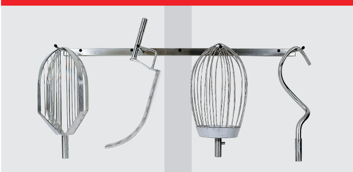
Tool rack, 91 cm