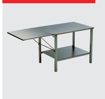
Stainless steel table for RN10