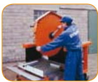
Easy access to the blade.