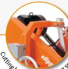
Cutting head with balancing spring.