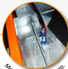
Mechanical water pump.

The CLIPPER Jumbo 1000 can only be used with 1000 mm blade.