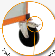
2 wheels with locking device.