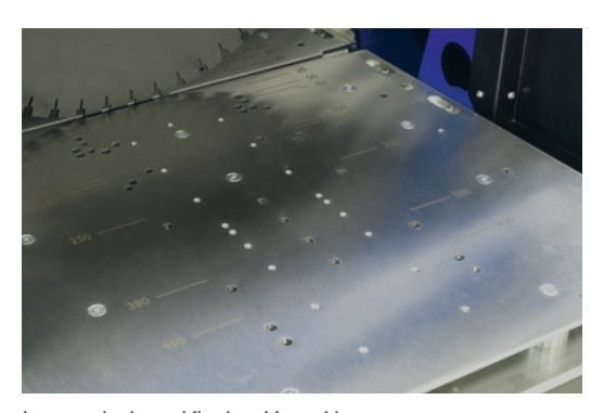
Integrated ruler and fixed position guides

The saw can be modified with a large range of accessories to cut cores, rectangular beams, trapezoidal prisms, overlay test specimens, semi-circular & wheel tracking specimens, and trimming of cylindrical specimens (both manually and automatically).