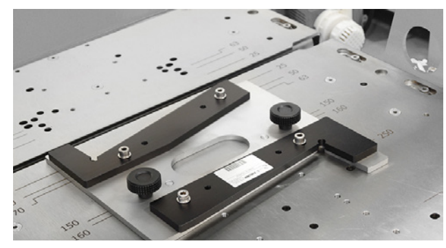
Trapezoidal specimen jig