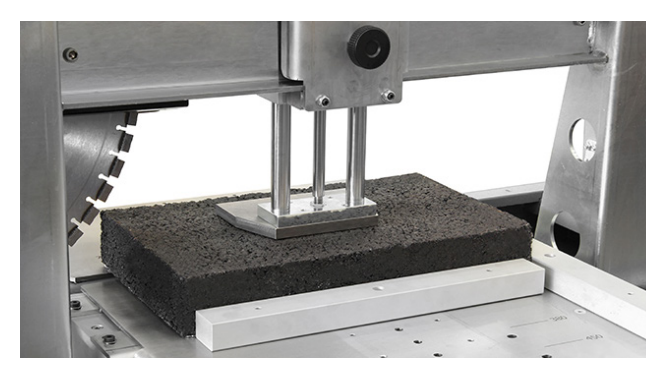
Prismatic sample clamp and reference blocks (standard)