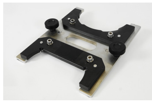
Overlay Test specimen jig