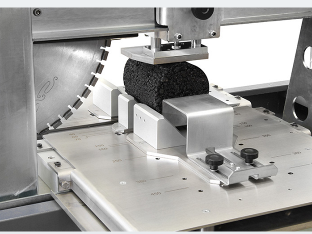
Manual core docking jig