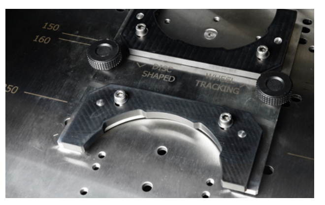
Wheel-tracking core, semi-circle and disk-shaped compact tension specimen jig