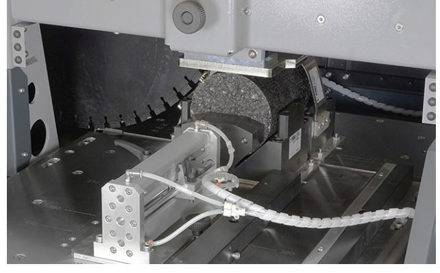
Automatic core docking jig