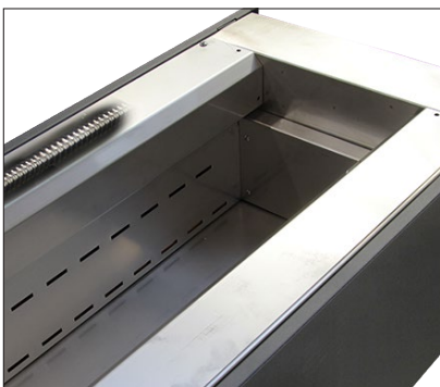
Detail of the stainless steel water bath with the protection for the lateral driving screw rods, by stainless steel too.

This model fully satisfies and exceeds ASTM D113, ASTM D6084, AASTHO T51 and EN 13398 requirements. To obtain the required 25°C with ±0.2°C tolerance, circulation of cold water is necessary. A water chiller (see accessory 81-PV1002) is ideal for this and may already be available in the laboratory but mains water can also be used. If the ambient temperature goes over 25°C, as in tropical areas, and cold mains water is not available, the use of a water chiller is mandatory.