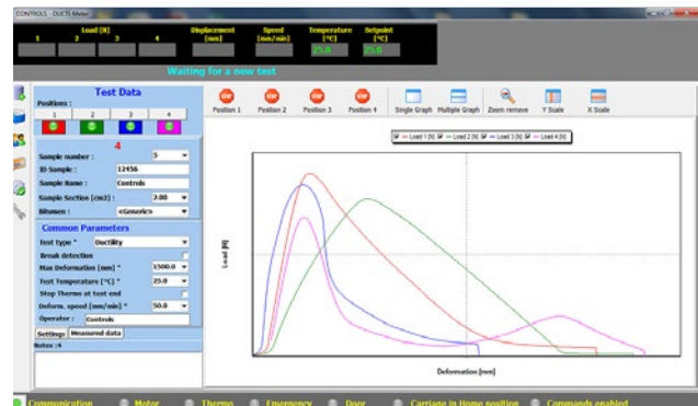
Typical screenshot of the machine software

As the high performance version 81-PV10B02, this research model is PC controlled using dedicated software.