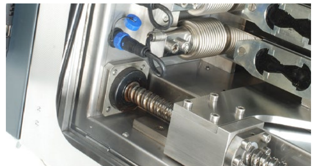
Detail of 81-PV10B02 and PV10C12 with four 81-PV10020 load cells and briquette molds