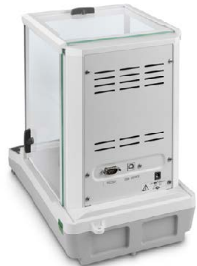
KERN ACS/ACJ with standard data interface RS-232 and USB data interface

The bestseller in analytical balances, with high-quality single-cell weighing system, also with EC type approval [M]