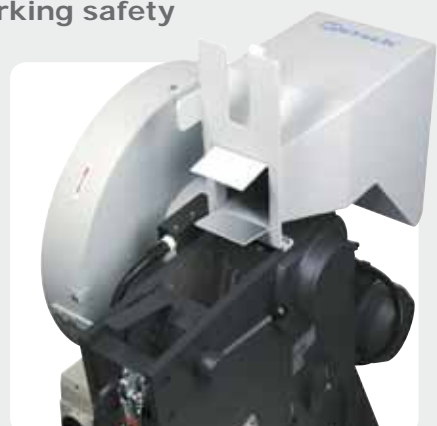
The BB 200's hinged cover permits easy access to the grinding chamber.

removed. The Jaw Crushers run very smoothly and quietly. Due to their solid design, RETSCH Jaw Crushers are virtually maintenance-free.