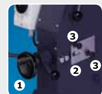
BB 100 to BB 300