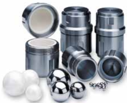
Screw-top grinding jars for MM 400

The grinding result is greatly influenced by the grinding tools. The choice of jar volume, ball charge and material depends on the type and amount of sample. In order not to falsify the subsequent analytical determination, a neutral-to-analysis material should be selected.