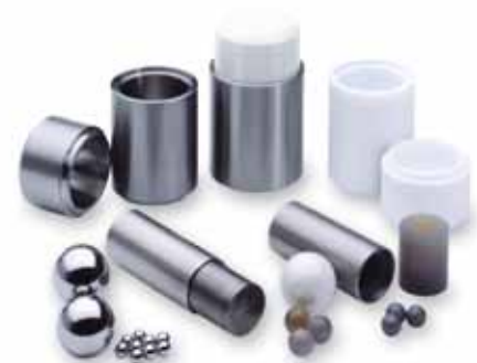
Grinding jars with push-fit lids for MM 200

The pulverization energy is determined by the density and weight of the ball material. The higher the ball weight and density, the higher the pulverization energy. The jar and balls should always be made of the same material. The table shown below is intended to help you to select suitable grinding tools.