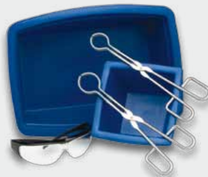
The CryoKit consists of: 2 insulated containers (1 and 4 liter), 2 pairs of grinding jar tongs 1 pair of safety glasses.

The screw-top grinding jars are particularly suitable for cryogenic grinding, as they remain hermetically sealed until they have regained room temperature. This prevents atmospheric humidity from condensing on the cold sample as water vapor which could penetrate the sample and falsify the analytical results. However, jars made from agate or ceramics should not be cooled with liquid nitrogen in order to avoid damages during the grinding process.